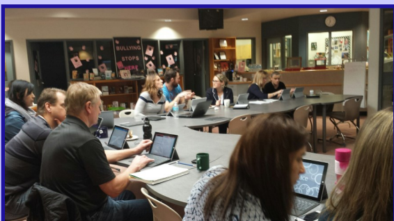
Microsoft Office 365 Workshop Feb 2016

"I was scared to try it, but once I figured out how to use it—it was powerful! We had a lot of information to compile and being able to save time by working together in the same document was invaluable."