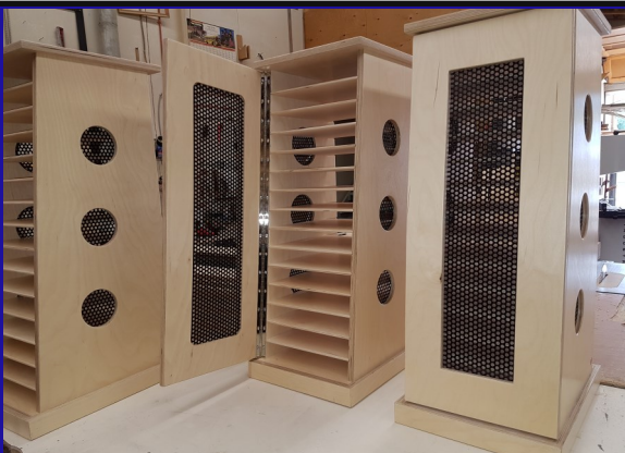
Ipad holders designed and built by SD 58 carpenters.