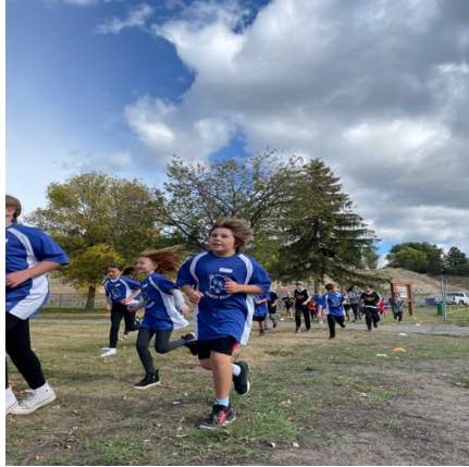
Cross Country Run.