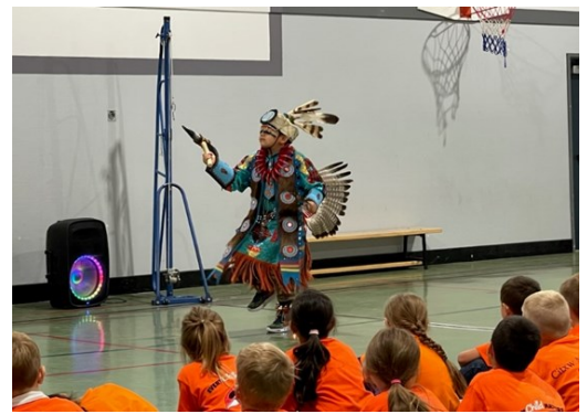
Truth & Reconciliation Assembly.