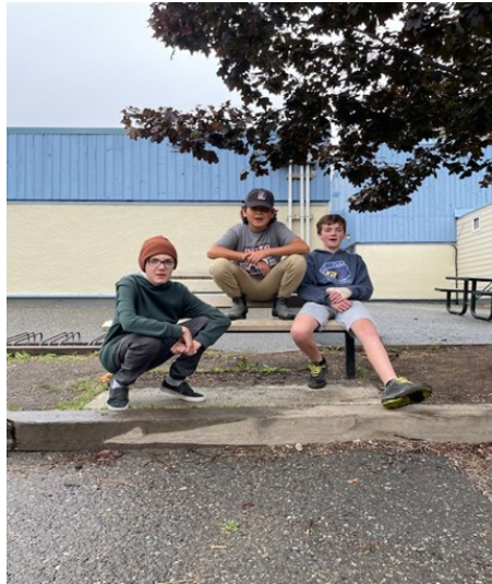
Merritt Bench Open House. Parents and kids playing.