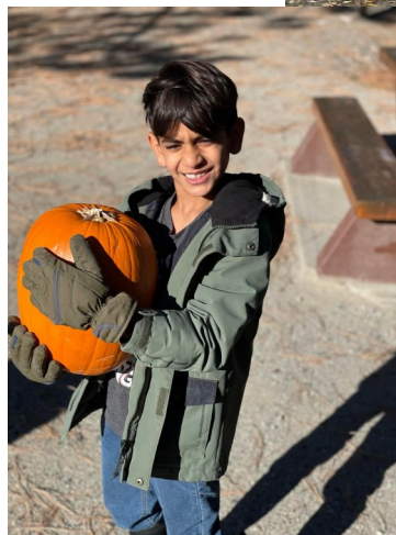
Pumpkin Patch Fun